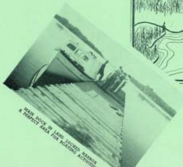
MAIN DOCK IN LAKE LOCKER HARBOR A PERFECT AREA FOR BOATING ACTIVITIES

Instruction periods for the various sports activities will help those boys and girls who wish to gain greater proficiency.