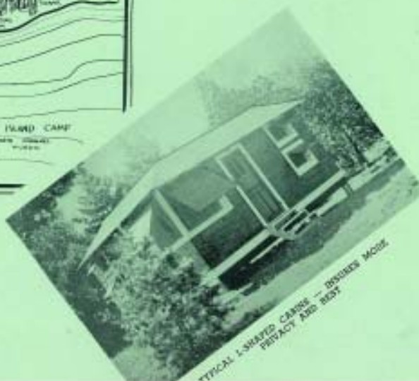
TYPICAL I-SHAPED CAMPS — INSURES MORE PRIVACY AND REST

John Island is situated in the South Channel of Lake Huron between Cubac on the mainland and Gore Bay on Manitowish Island. The camp property consists of 270 acres of land at the western end of John Island. It includes 100 acres of the main island, two small islands and about two half of Adams Island. This group encompasses a fine harbor, shielded from winds in every direction. A port-like 100 acre section has a half mile of the finest sand beach to be found anywhere. The