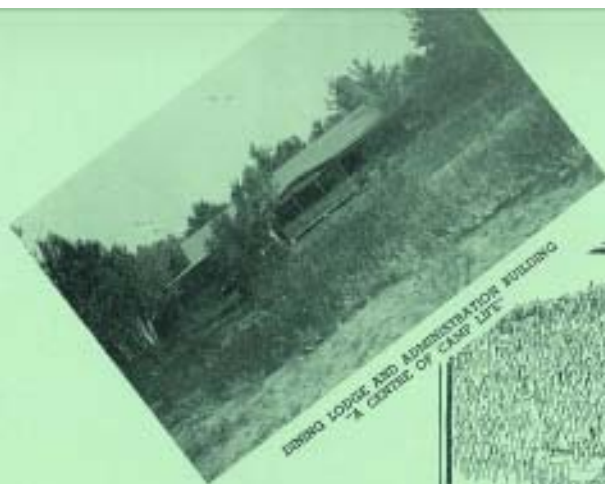
EDWARD LODGE AND ADMINISTRATION BUILDING — A CENTER OF CAMP LIFE

Begins its first year of history in 1954 — Happy the boy and girl who shares in this first year of adventure